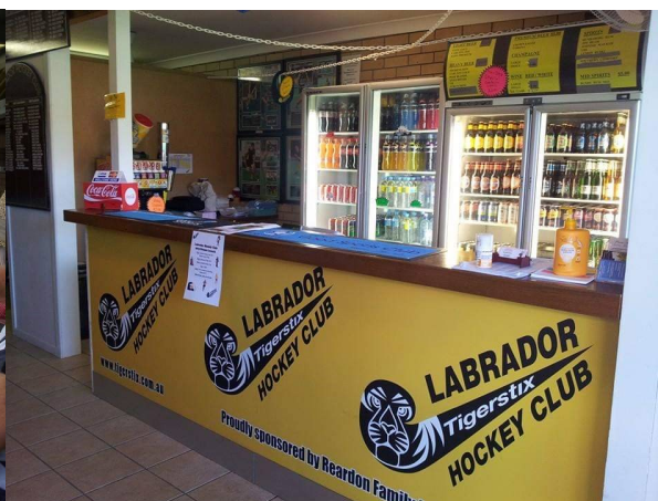
Figure 5 - Clubhouse bar

In 1997 Club officials negotiated with Gold Coast Hockey Association (GCHA) to move from Palm Beach to Hunt Park as no suitable land was being made available by GCCC to establish a synthetic surface hockey pitch for the Gold Coast. Officials traded away three grass hockey fields and the baseball diamond to make way for the GCHA synthetic pitch and clubrooms. Baseball was no longer possible at Labrador Sports Club.