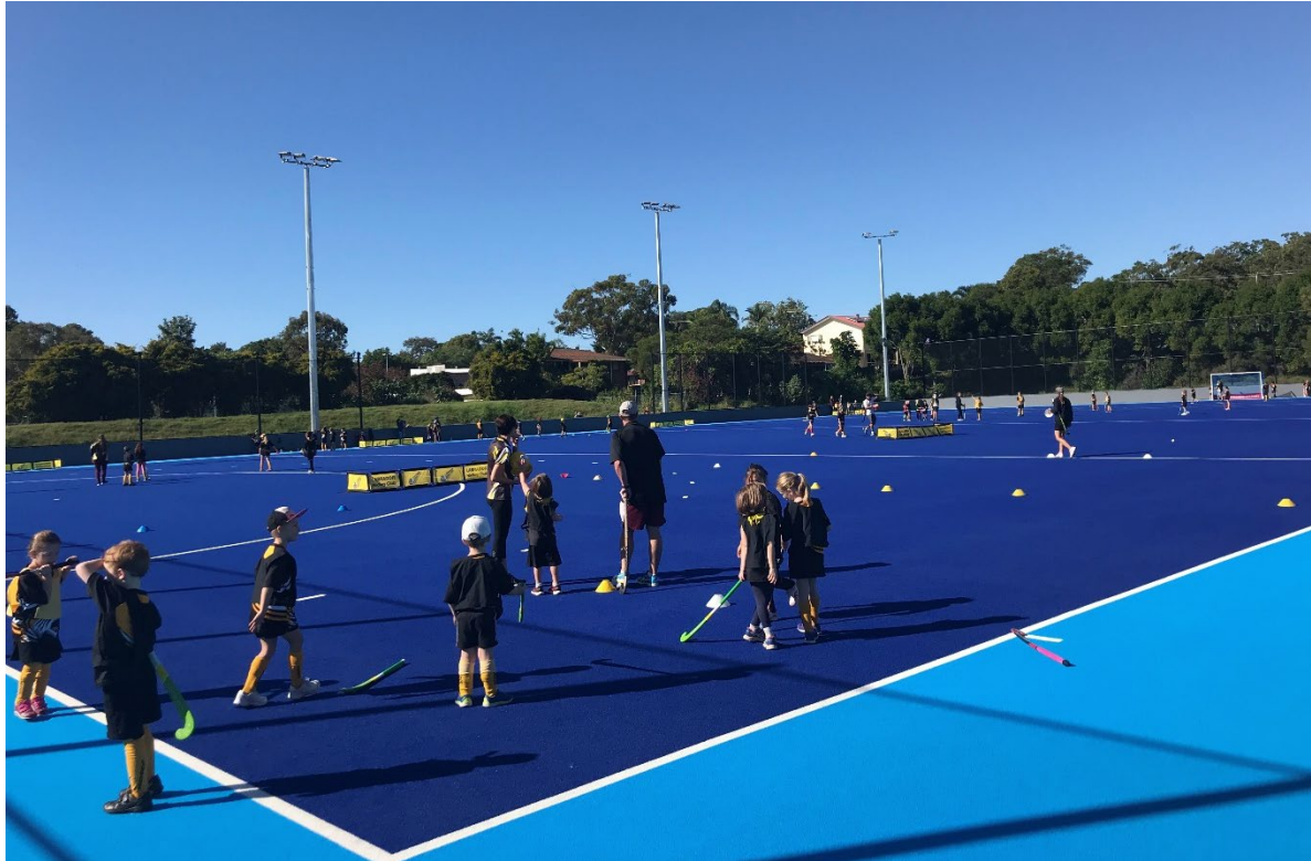
Figure 10 - Labrador Families' Field (Junior Dev)

The Club was also awarded, as compensation for the demolition of its own synthetic hockey pitch, the first right of use on the eastern synthetic pitch at GCHC which is known as Labrador Families' Field.