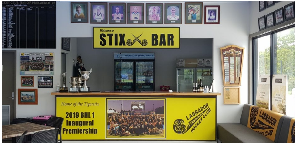
Figure 8 - New Labrador Tigerstix Clubhouse bar in GCHC precinct

During the GCHMG formation negotiations, Labrador Hockey Club was awarded the Club in residence at Gold Coast Hockey Centre (GCHC) in recognition of being the Club's home for the last 50 years. Labrador Tigerstix has subsequently developed its clubhouse with a bar area and seating for 80 patrons.