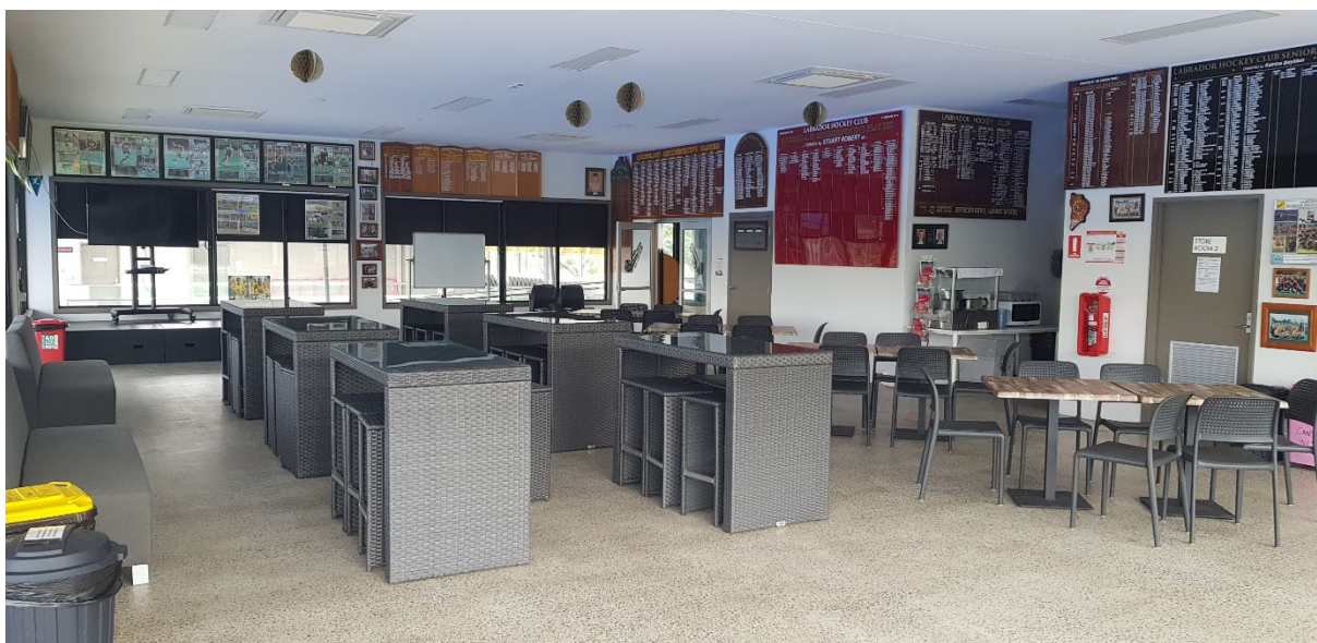
Figure 9 – Labrador Tigerstix clubhouse in GCHC precinct