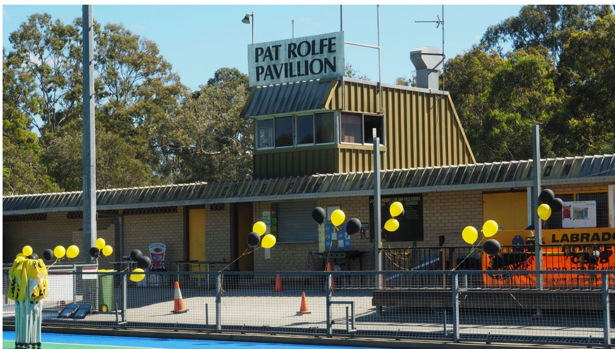
Figure 6 - Clubhouse view from synthetic field

In 1997 Club officials negotiated with Gold Coast Hockey Association (GCHA) to move from Palm Beach to Hunt Park as no suitable land was being made available by GCCC to establish a synthetic surface hockey pitch for the Gold Coast. Officials traded away three grass hockey fields and the baseball diamond to make way for the GCHA synthetic pitch and clubrooms. Baseball was no longer possible at Labrador Sports Club.