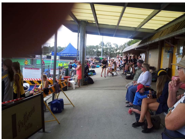
Figure 4 - Main field viewing area outside clubhouse