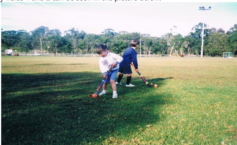
Figure 3 - fields 1 & 2

Hockey fields 1 and 2 can be seen in the picture below.