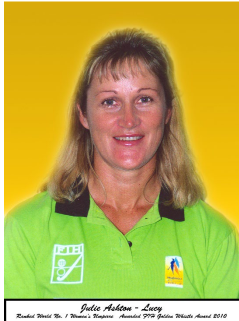
Figure 19 - Julie Ashton Lucy, International Umpire

Julie Ashton-Lucy, former international “Golden Whistle” umpire, and her daughters have played for the club for many years. Ranked number 1 Women’s International Umpire at the 2002 World Cup, Julie continued to officiate at the 2006, 2010 and 2014 World Cups and umpired at the Athens, Beijing and London Olympics blowing the Gold Medal match in London before retirement from International Umpiring.