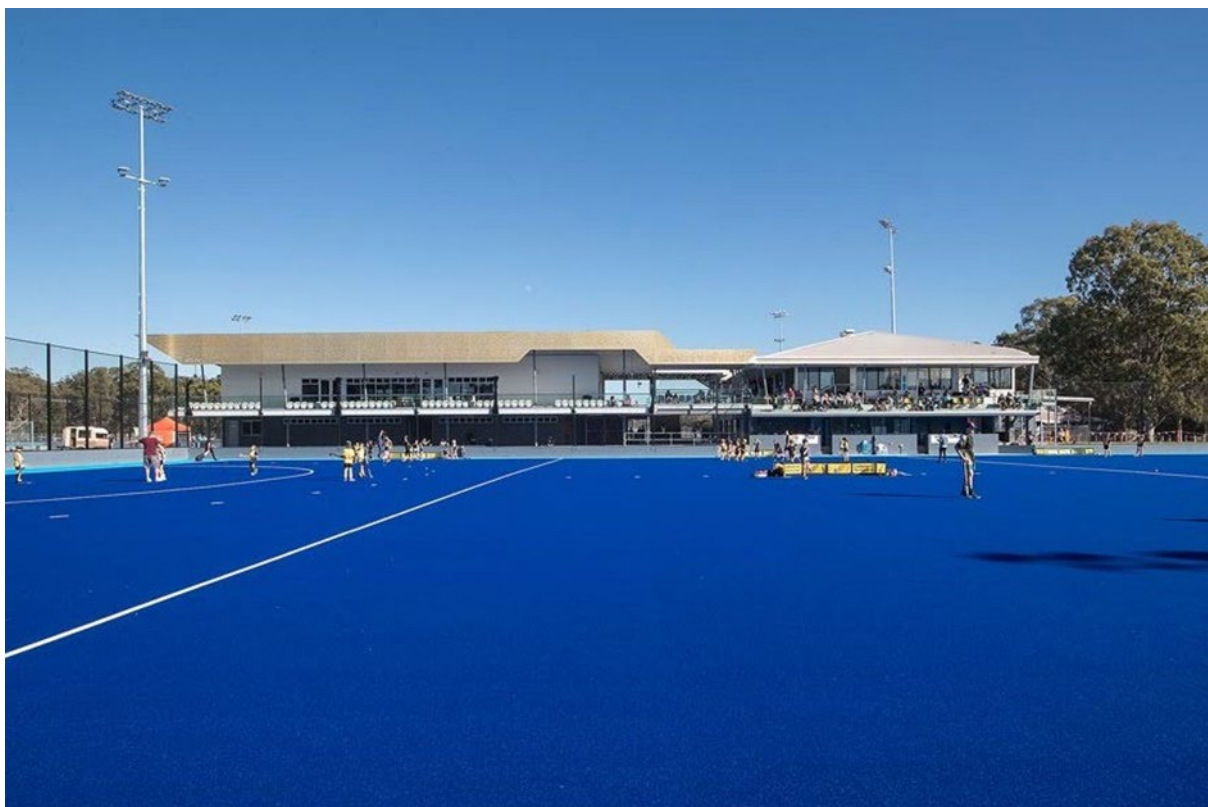
Figure 11 - Gold Coast Hockey Centre - Labrador turf and crowds outside Clubhouse (right end)