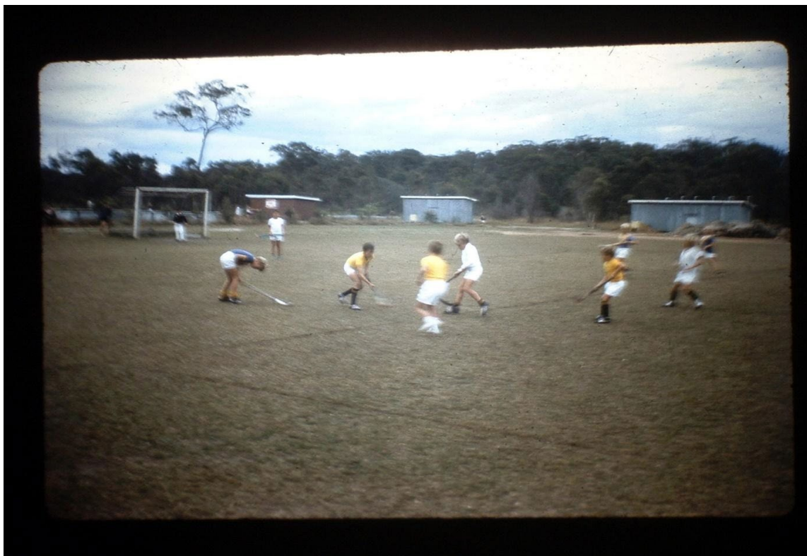
Figure 1- first hockey field constructed by members

Founding club members acquired the right to use the site on Musgrave Avenue from Gold Coast City Council (GCCC) where one hockey field was constructed by members as seen in the picture below.