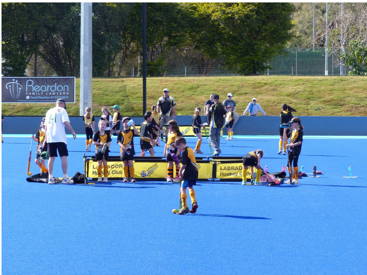
Figure 12 – Half time break for Tigerstix Rookies – Saturday morning Intraclub competition

Labrador Tigerstix has the highest participation rate for juniors on the Gold Coast, largely due to our professionally conducted Junior Hockey Development program which has been conducted since 1991. Labrador Tigerstix conducts lessons at primary schools from Ashmore to Gaven to expose children to the sport of hockey during February/March each year. Our newsletter mailing list includes 1,477 parents and supporters and we have a strong Facebook and Instagram following.