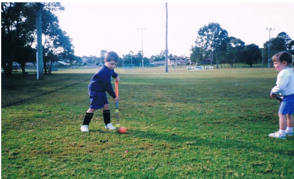
Figure 2 - Fields 3 4 and 5 and baseball diamond

Fields 3, 4, 5 and the baseball diamond area can be seen in the photo below.