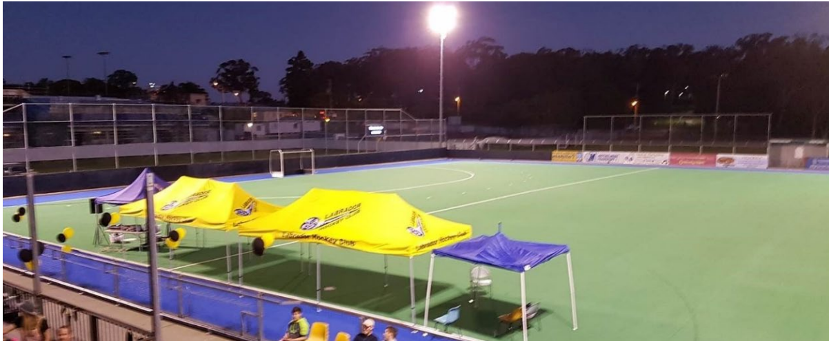
Figure 7 – Labrador Tigerstix synthetic field from top of Clubhouse

Previously, the Club had installed team dugouts, a six-cannon irrigation system, field width back nets, kerb and gutter drainage, fencing, water harvesting tanks and an electronic scoreboard. Club members then installed an inground sprinkler irrigation system to the remaining grass field and continued to maintain it to provide the highest quality grass hockey pitch.